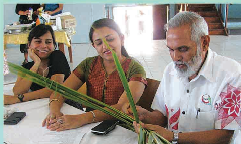
Staff weaving at Creative Circle

The Department of Language, Literature and Communications at the University of Fiji prides itself once again this year hosting Creative Circle on the theme: Celebrating Creativity, on August 12th, 2016. Enchanted scores of people in attendance marvelled various forms of creativity and this is a testimony of the success of the programme. This indisputably provided a meaningful display of creativity to our students at Saweni Campus.