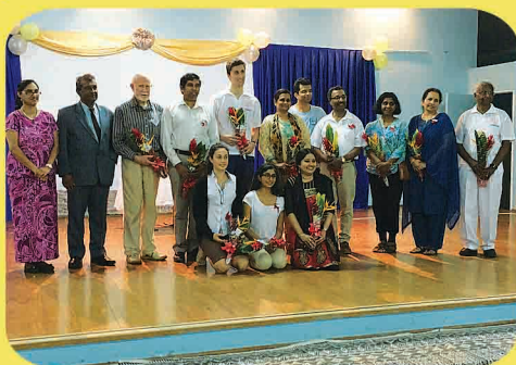
Speakers at the Sai Medical Conference held at The University of Fiji