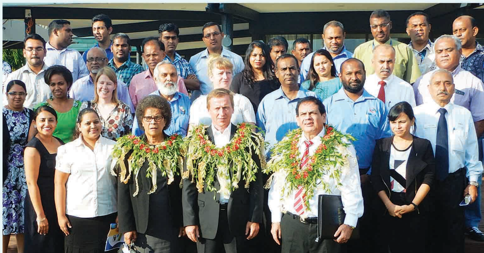
The Vice-Chancellor of The University of Fiji, Deputy Head of EU delegations and Director of the Fiji Higher Education Commission, The University of Fiji Council Member, the delegates from Hamburg University, Germany; Fiji National University, The University of South Pacific, SPC, FEA, FSC, Department of Energy, other industry people and possible students

The School of Science and Technology of the University of Fiji launched its first Centre of Renewable Energy (CORE) & Renewable Energy Management (REM) Masters Programme at the Tanoa Waterfront Hotel in Lautoka on Monday July 25, 2016. This project was initiated through The Secretariat of the African, Caribbean and Pacific (ACP) and funded by the EU as part of the ACP-EU Co-operation Programme in Higher Education (EDULINK II). The Title of the project was Renewable Energy in Pacific Islands: Developing Skills and Capacity (EPIC) Project.