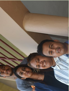
UniFiji MBBS and Language, Literature and Communications (LLC) students.