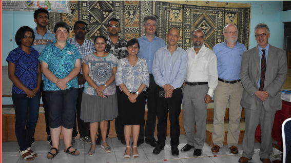
UniFiji staff with the lead authors from the Intergovernmental Panel on Climate Change’s (IPCC) Working Group II (WG II) at the final COP23 seminar session.

“I have no prior knowledge of the Hindi language but during the course of the short course, I not only learnt to speak and write basic Hindi, I learnt about the Hindu culture,” she said (in Hindi).