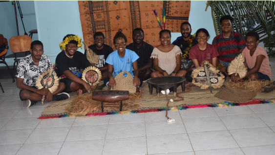
LLC students from the region, during the Creative Circle program.