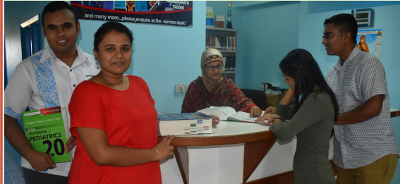
Students borrowing books and gaining from the vast knowledge at the Library.