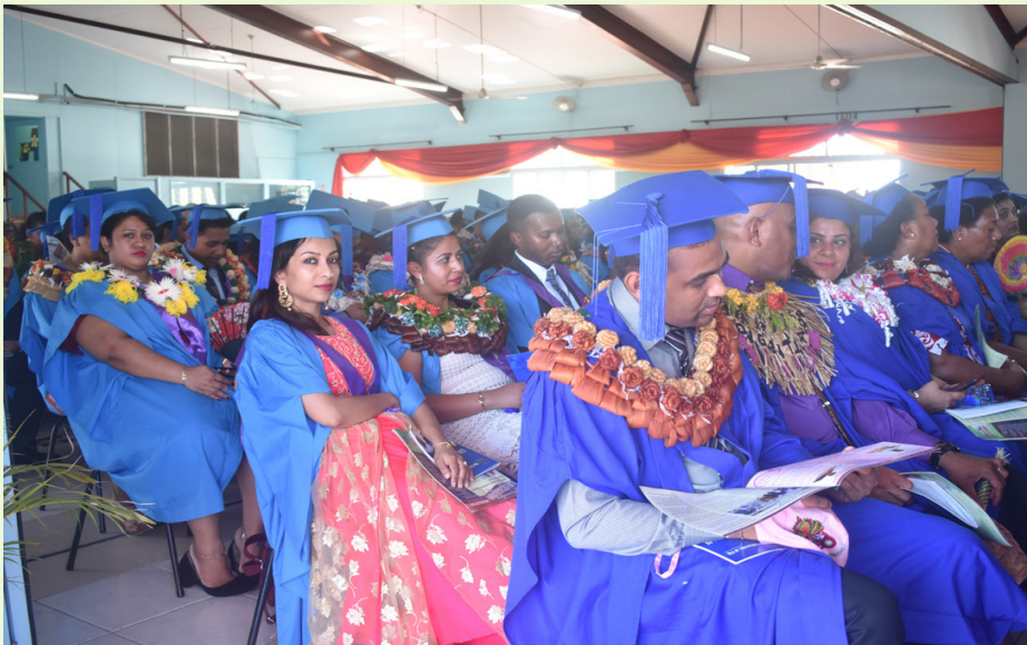
Graduating students at the December graduation ceremony.

Graduation is an important event in The University of Fiji’s calendar. We believe that graduation marks the end of one journey and the start of a new one. Graduation is a time for celebration; a time to look back at the seeds of one’s hard work and the time to look forward to the fruits of the hard work.