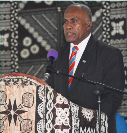
Honourable Laisenia Tuitubou, Minister for Youth and Sports, addressing student.

While speaking at the graduation ceremony, Chief Guest, Honourable Laisenia