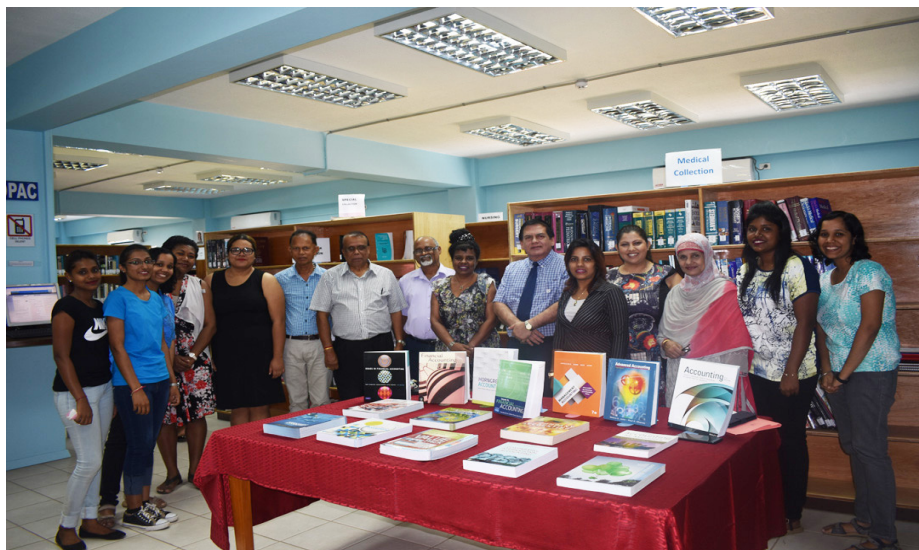
Staff and students at the University library.