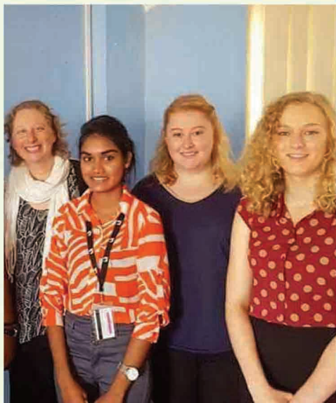
Exchange students from Monash University