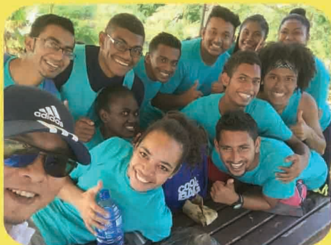
UPSM Sports Day