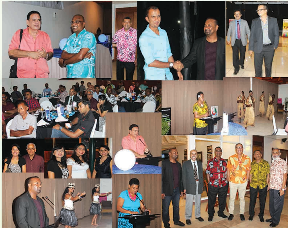
The guest and staffs of UoF networking at the event

The second Academic-Industry collaboration event is scheduled at the Grand Pacific Hotel in Suva on 19 August.