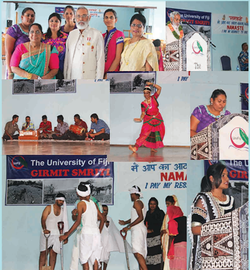
Clicks of the Girit Day celebration

The University held a Girit Day celebration on the 27th May this year. 14th of May 2016 marked the 137th Anniversary of the start of the Girit in Fiji.