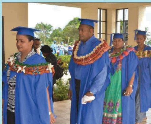
2016 April Graduates

MORE than 320 students graduated from The University of Fiji's Saweni Campus on April 22 joining a rich pool of alumni's who have made a name for themselves in local and international career markets.