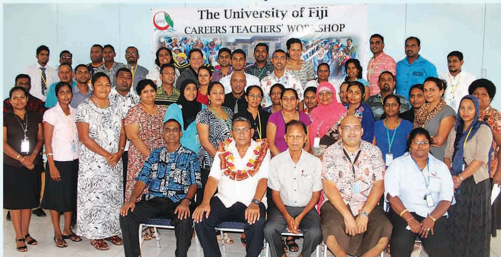
The organisers with the participants of the workshop

The 3rd Careers Teachers' Workshop was successfully organized on 21st May 2016. There was a very good turnout of the careers teachers from the Western Division. Altogether 48 teachers from 43 secondary schools attended the workshop.