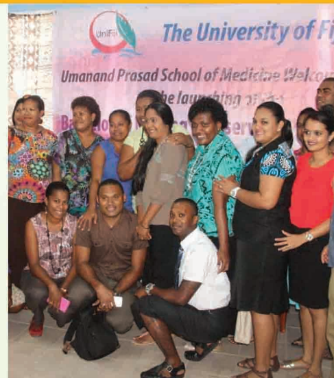
Bachelor of Nursing in-service programme students