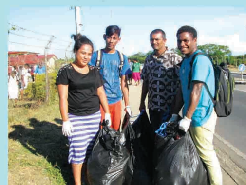
Science students help in clean up campaign