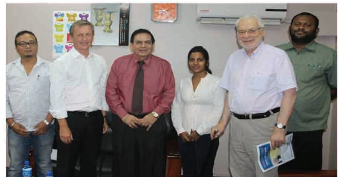
The Vice-Chancellor's Public Lectures: Chairman of the Institute for Danube and Central Europe Dr. Erhard Busek (front extreme right) spoke about European integration and the European Union at the UoF May 16.