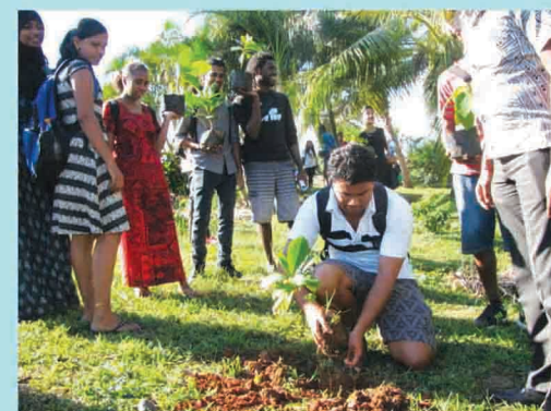
Science students planting Tavola trees

Oct 4 World Animal Day Oct 16 World Food Day