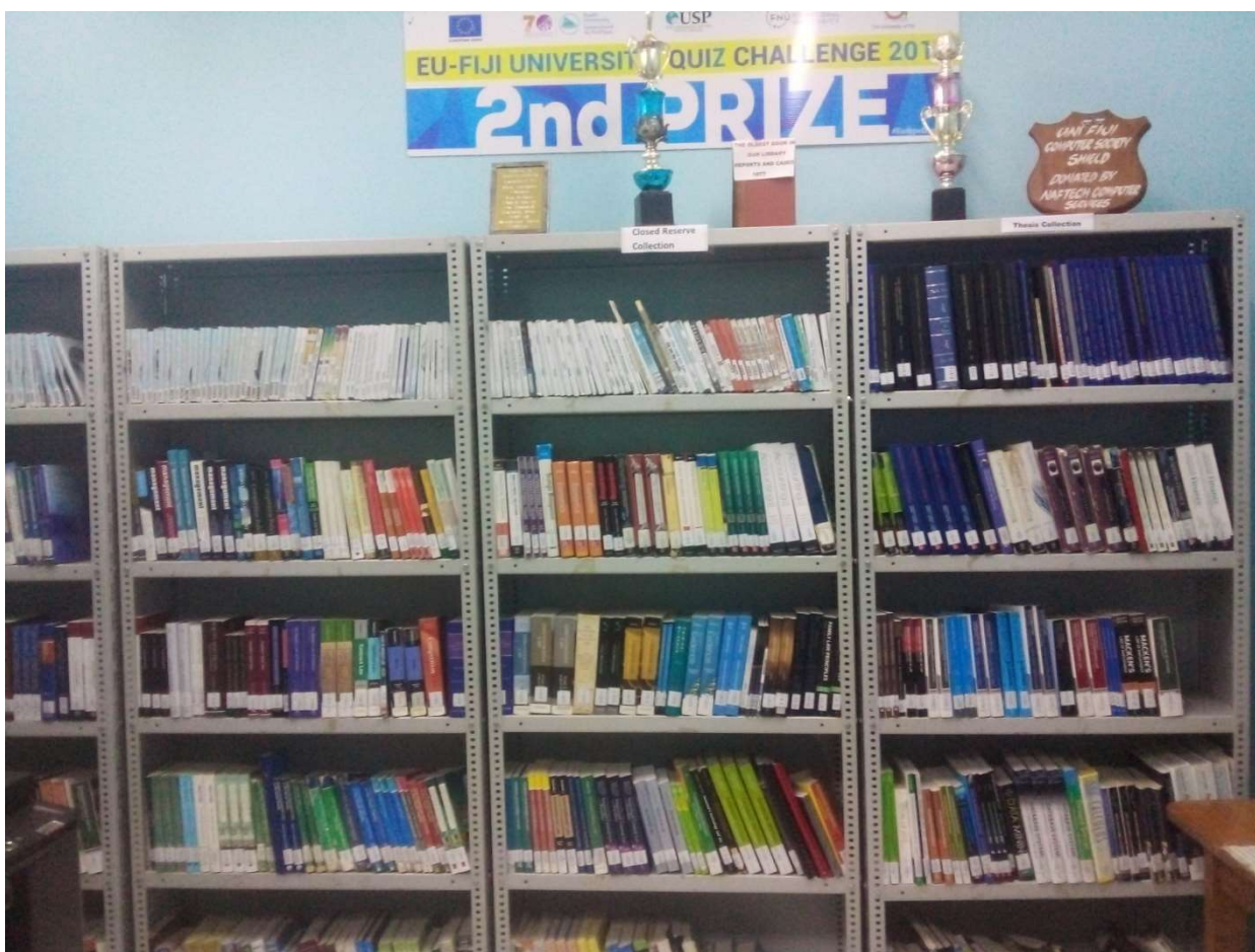
The Closed Reserve Section at the Saweni Campus Library

This allows all the Library users to receive equal opportunity to use the textbooks for their curriculum needs.